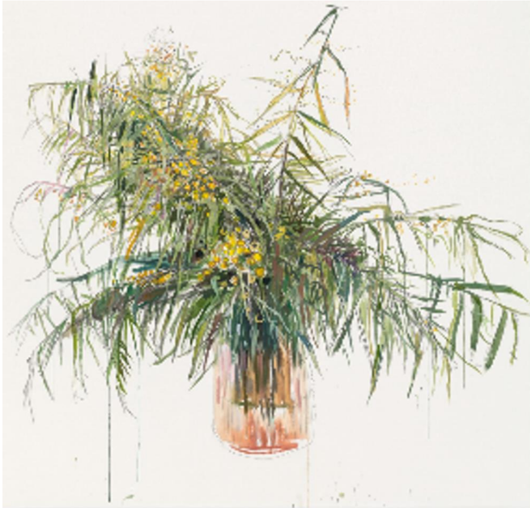
Flower portrait I 2020 132 x 135 cm Gouache on Paper