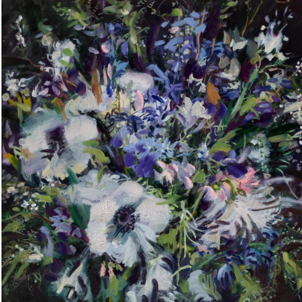
Blue Violet portrait II 2020 73 x 73 cm Gouache on Paper