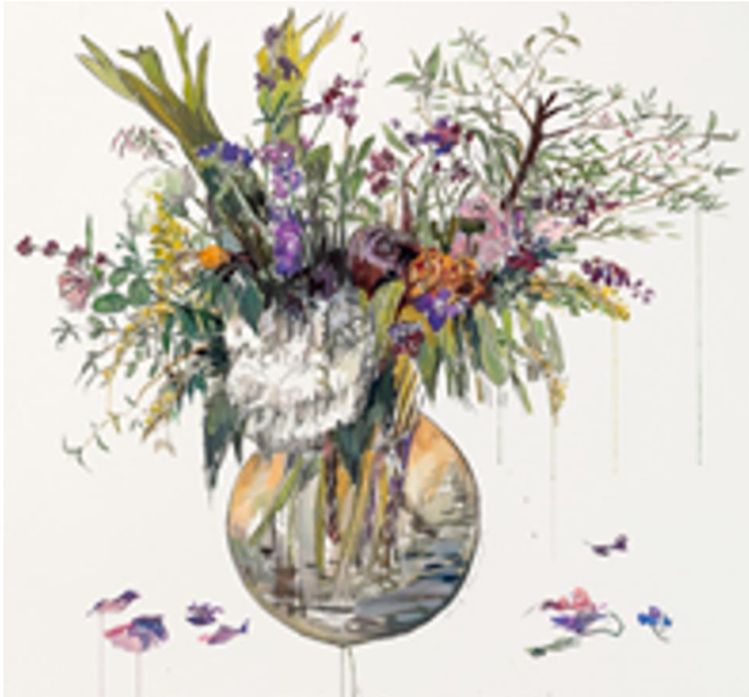
Flower portrait II 2020 132 x 135 cm Gouache on Paper