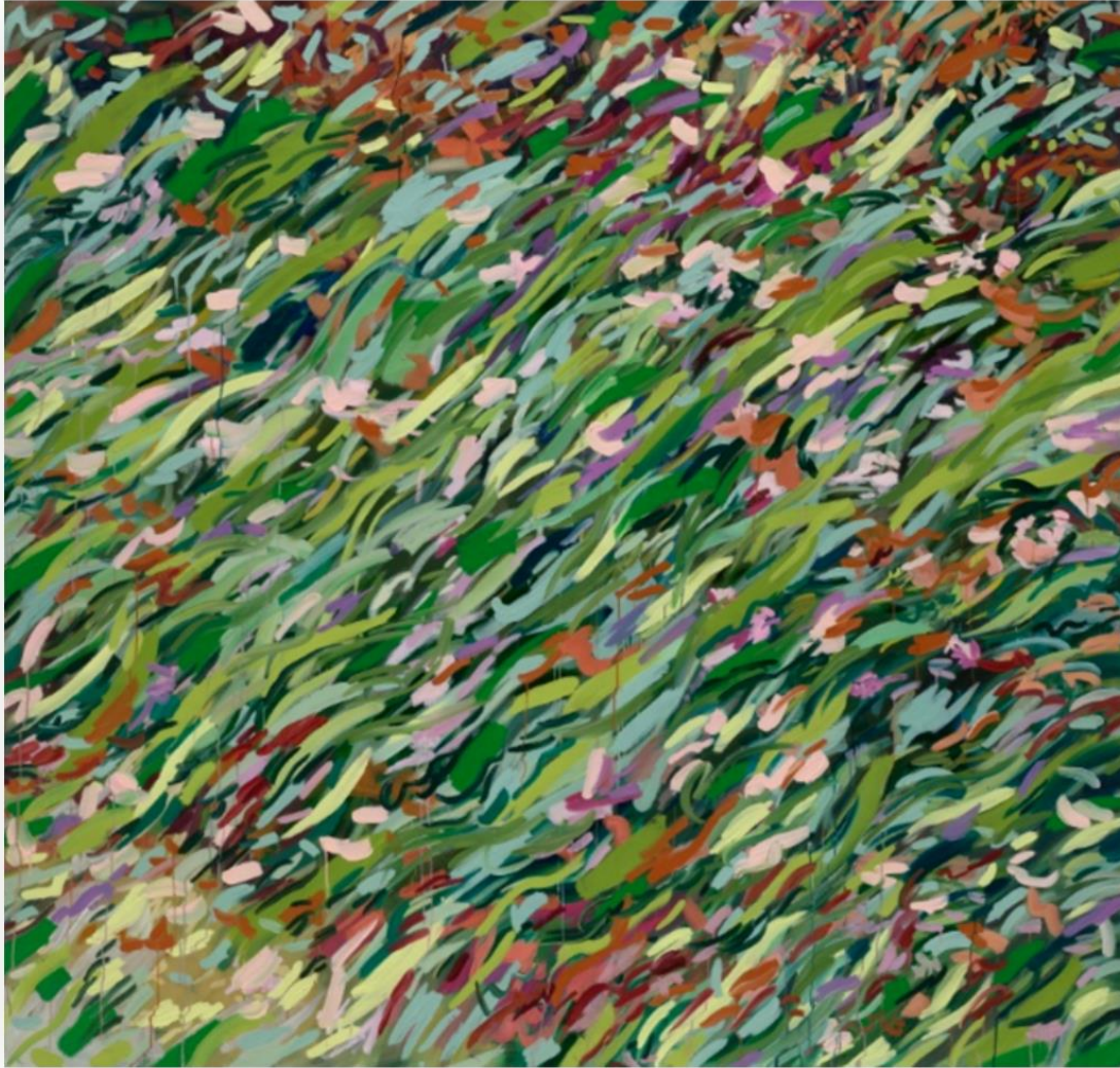
Green abstract I 2020 200 x 205 cm Oil on canvas