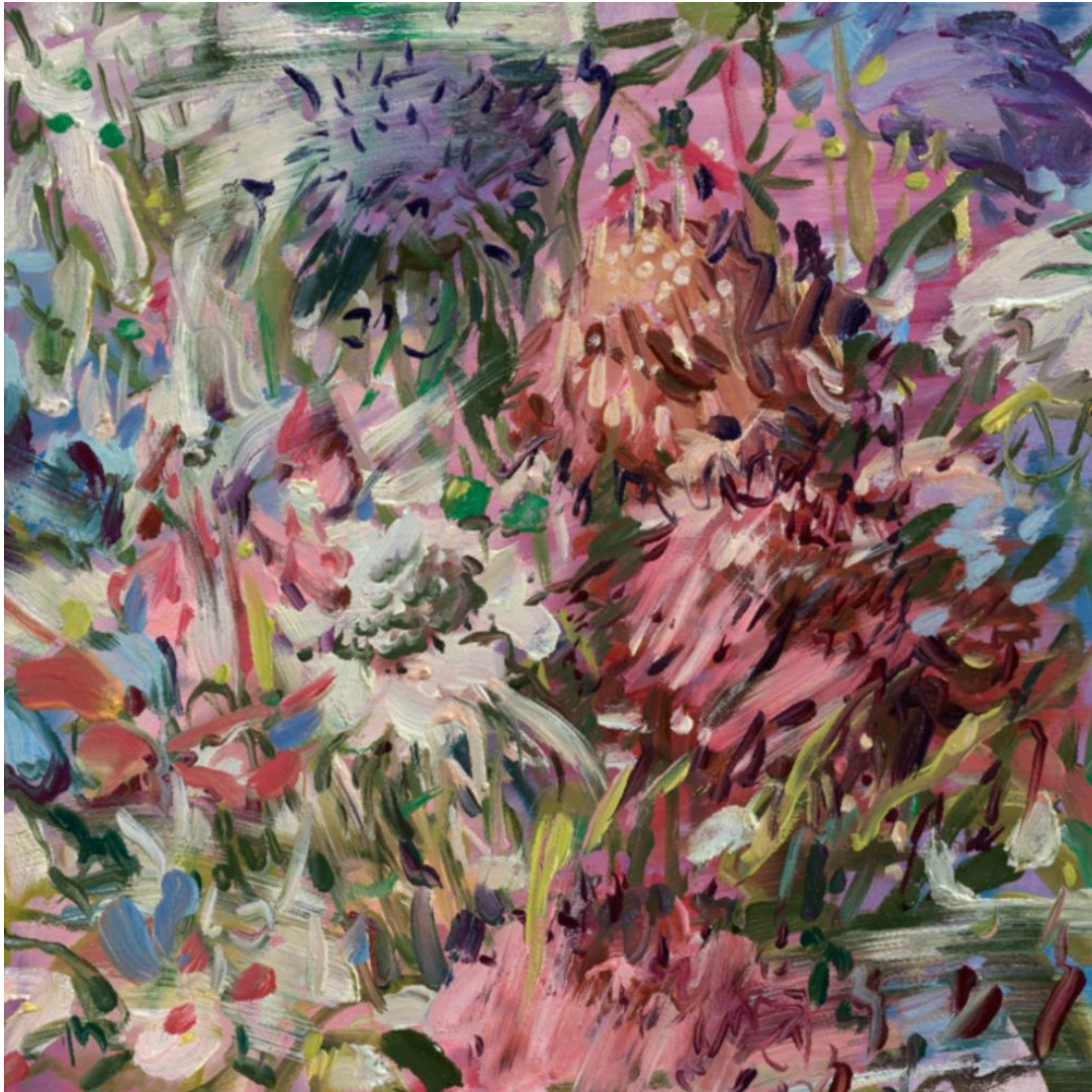
Flower portrait 9 2020 31 x 31cm Gouache on Paper