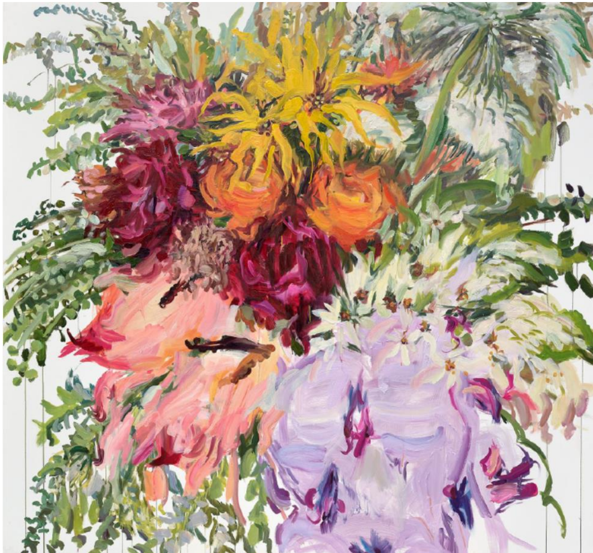
Peony and Phalaenopsis 2020 202 x 214 cm Oil on canvas