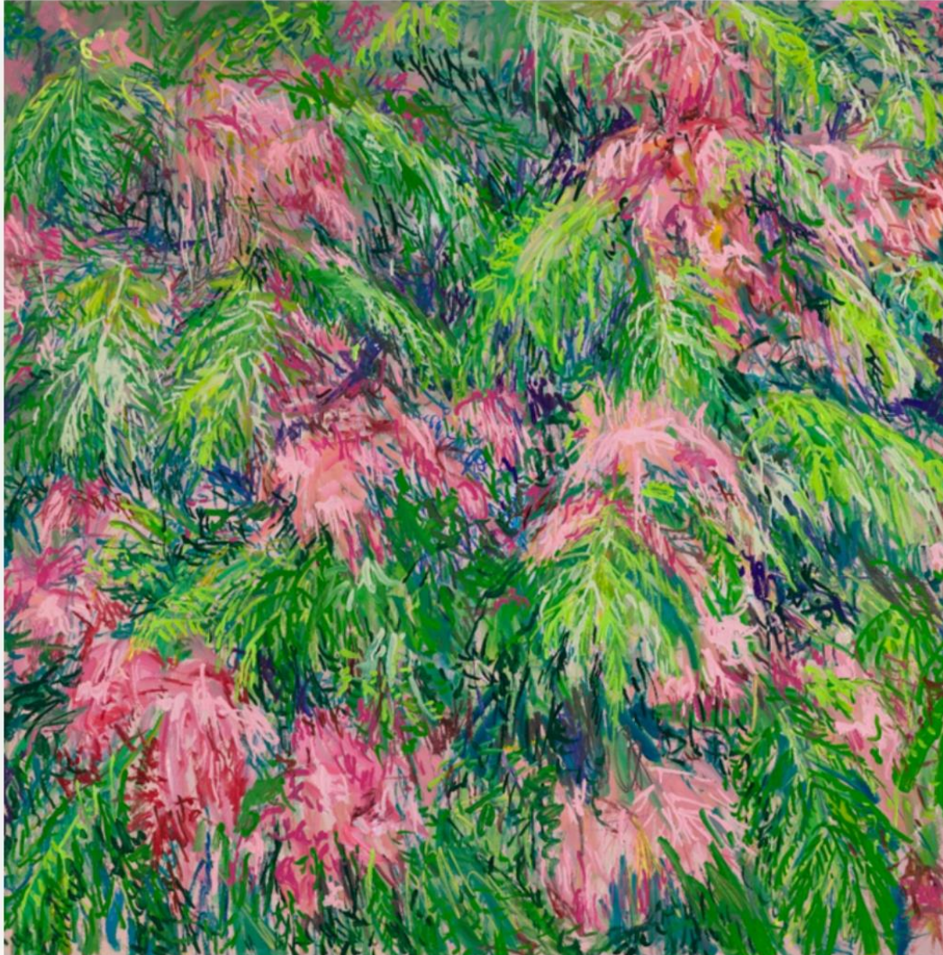
Mimosa tree 2020 160 x 160 cm Oil on canvas