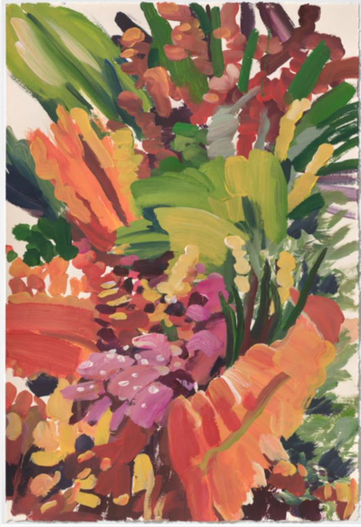
Wet drawing IV 2020 56 x 38 cm Gouache on Paper