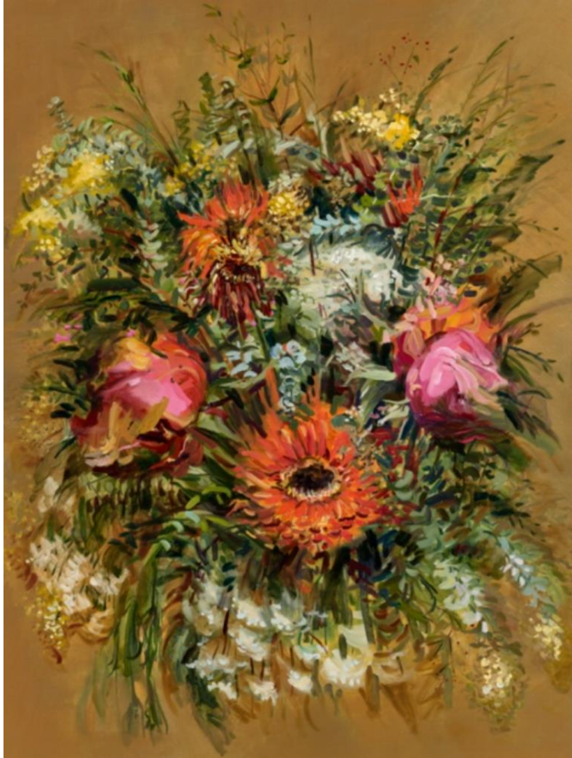
Flower portrait Orange Gold 2020 145 x 112 cm Oil on canvas