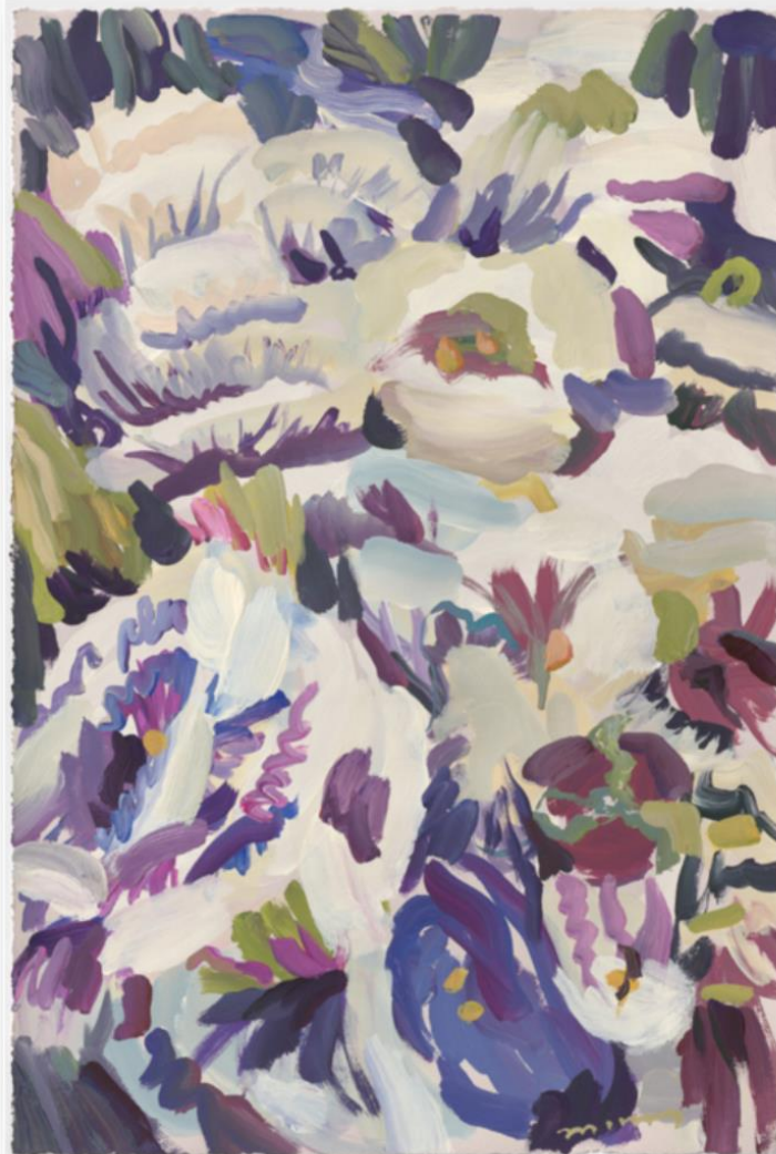
Wet drawing III 2020 56 x 38 cm Gouache on Paper