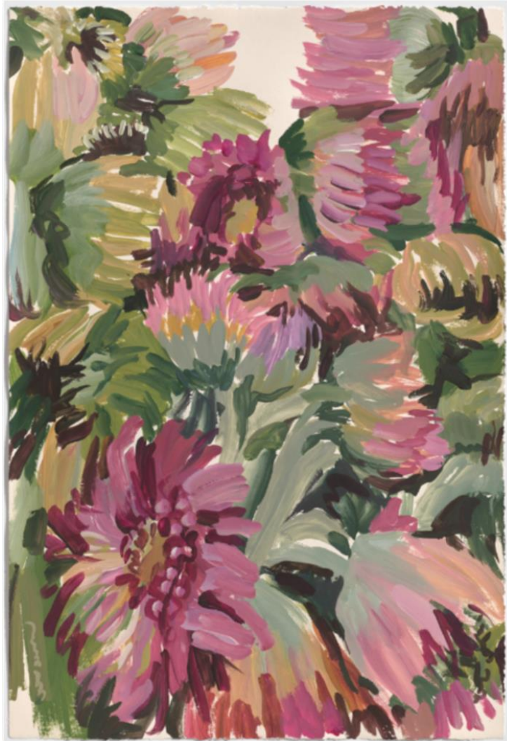
Wet drawing II 2020 56 x 38 cm Gouache on Paper