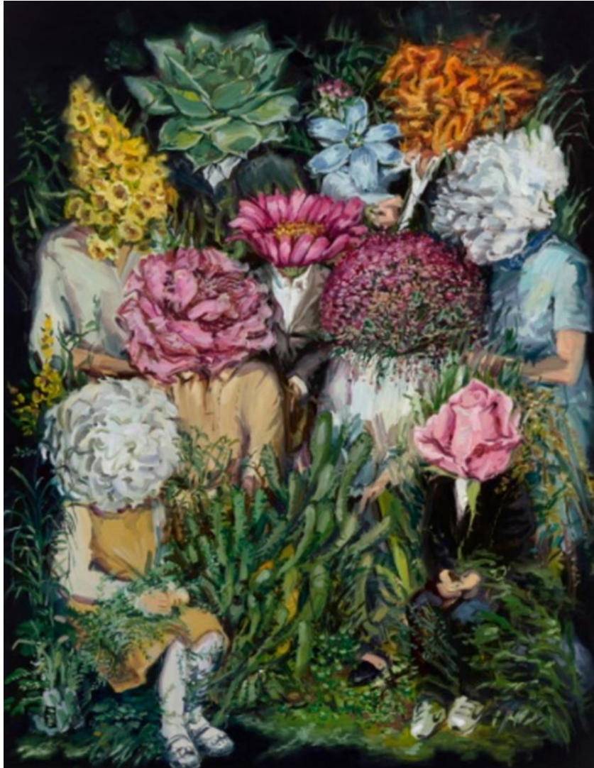
Rose family 2020 130 x 97 cm Oil on canvas