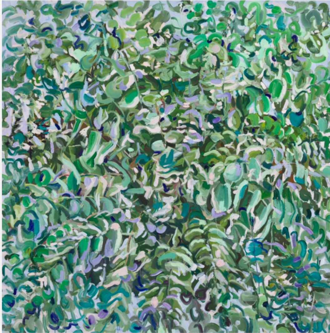
Eucalyptus 2020 160 x 160 cm Oil on canvas