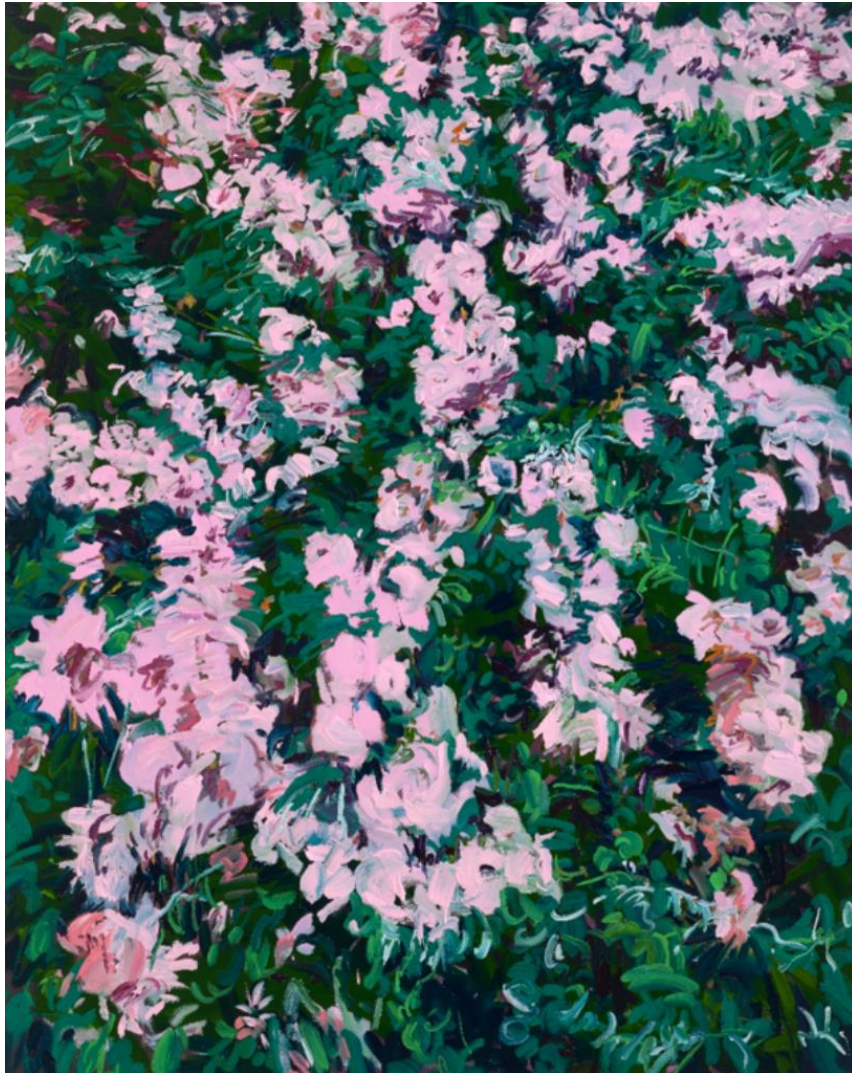
Rose 2020 162 x 130 cm Oil on canvas