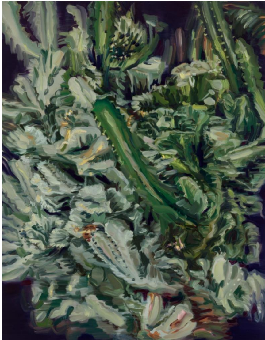
Green portrait I 2020 130 x 90 cm Oil on canvas