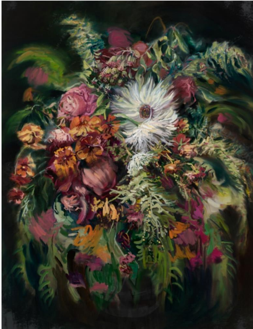
Flower portrait Black and grey 2020 145 x 112 cm Oil on canvas