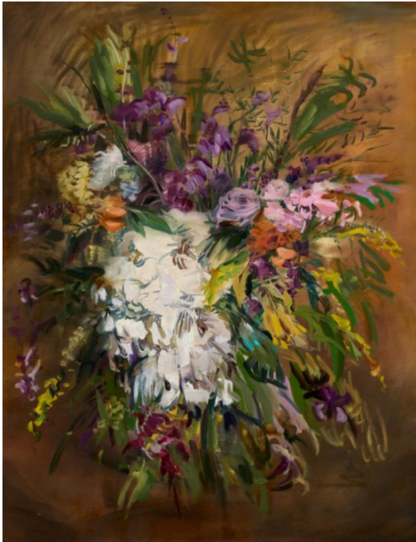
Flower portrait burnt 2020 145 x 112 cm Oil on canvas