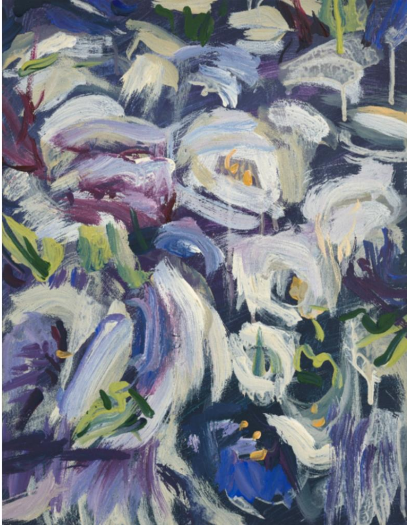
Blue Violet portrait II 2020 41 x 32 cm Gouache on Paper