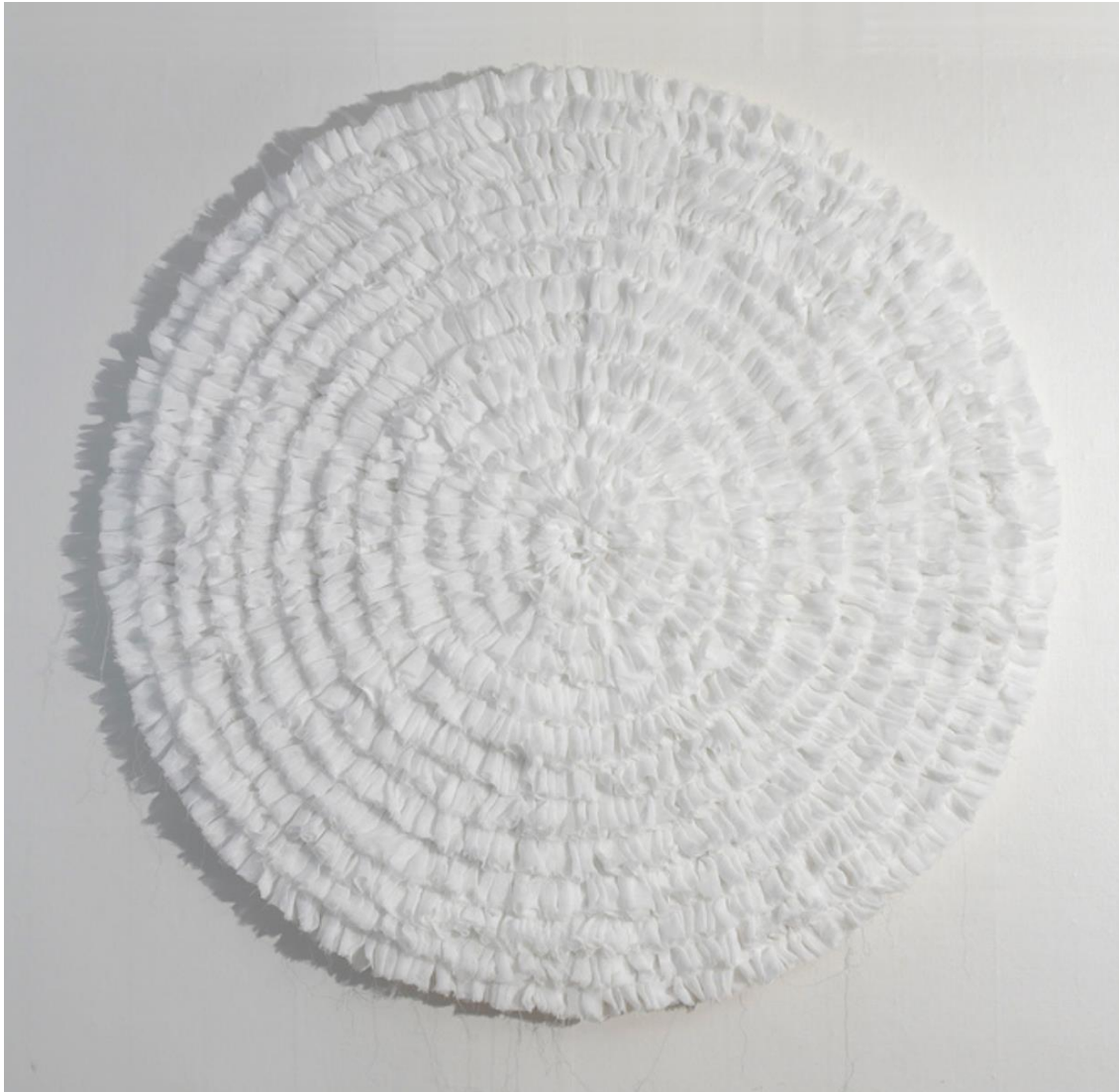
Untitled (White Dreams), 2018 gauze bandage 150 cm diameter