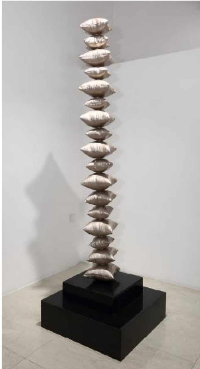
Metamorphosis, 2017 Cast bronze 120 × 18 × 18 cm