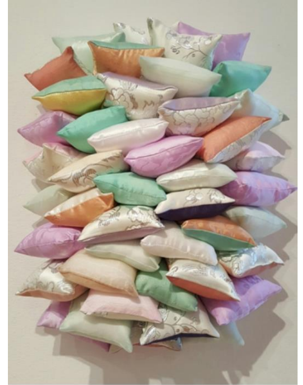
Seed Series, 2013, fabric, cotton, 30 x 30 x 10 cm (each)