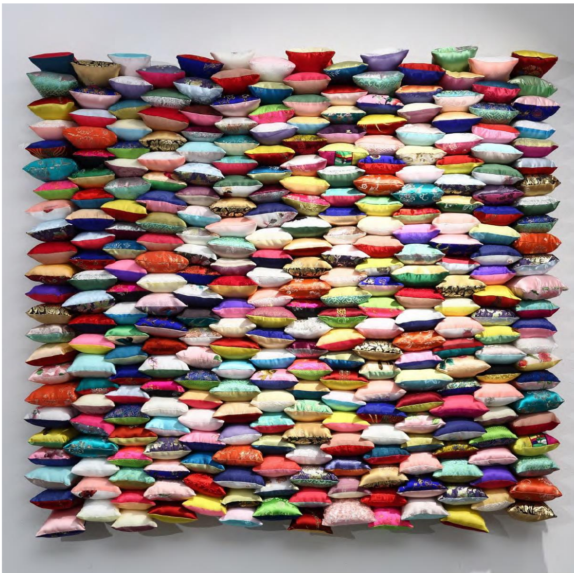
Pillows 2018 120 x 120 cm Hanbok fabric, cotton, wire