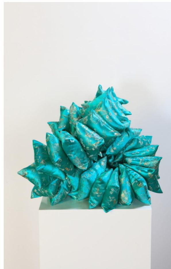
Molding Series, 2018, Size Variable, Hanbok fabric, cotton, wire