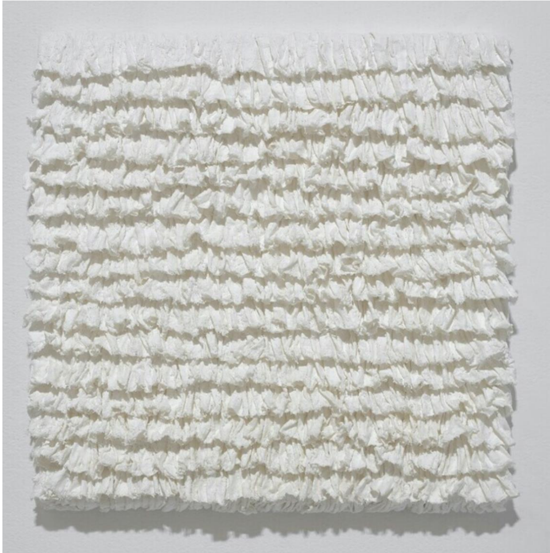
Untitled (White Dreams), 2018 gauze bandage 150 x 150 cm