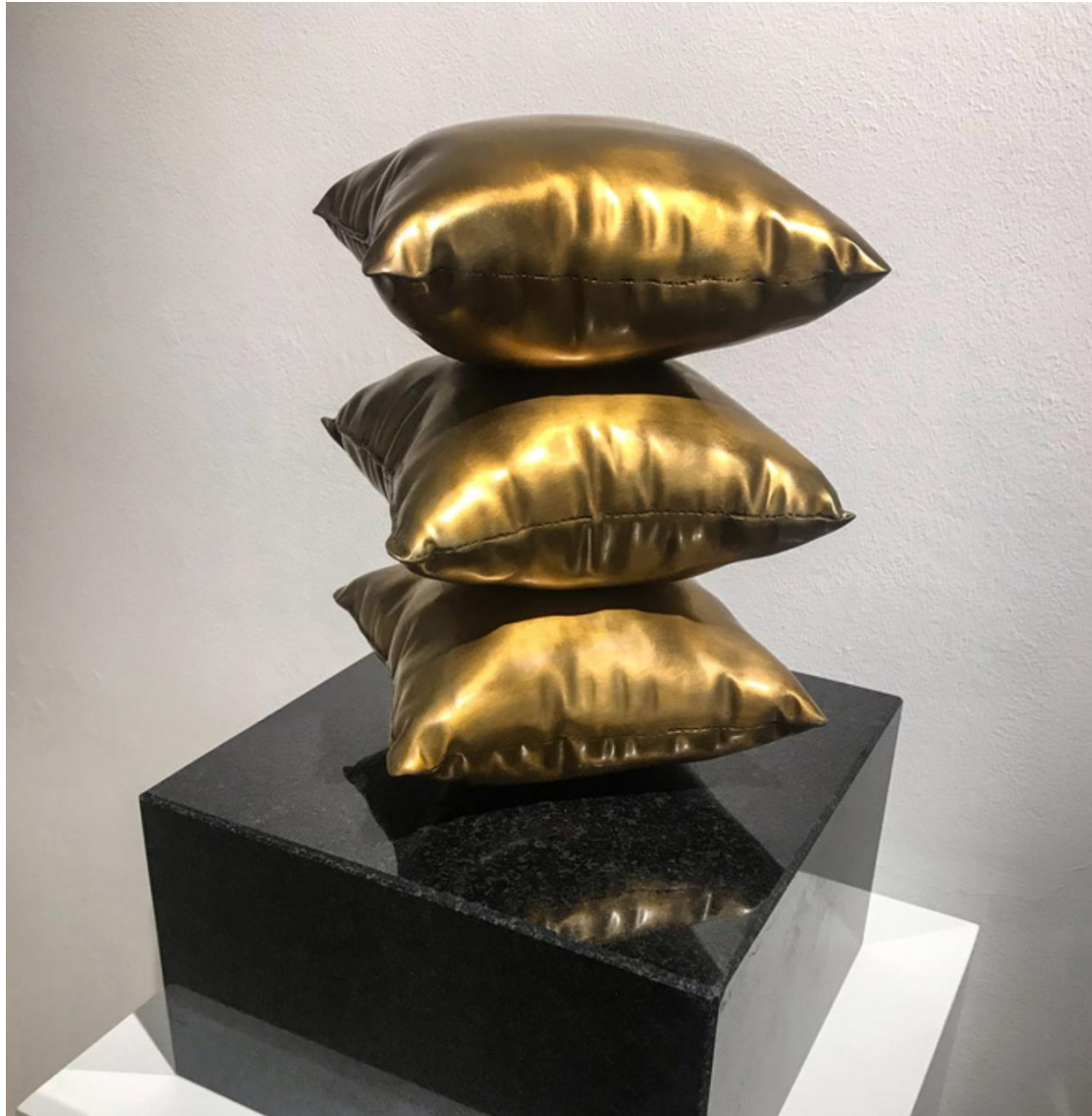
Metamorphosis, 2017 Cast bronze 30 x 30 x 50 cm