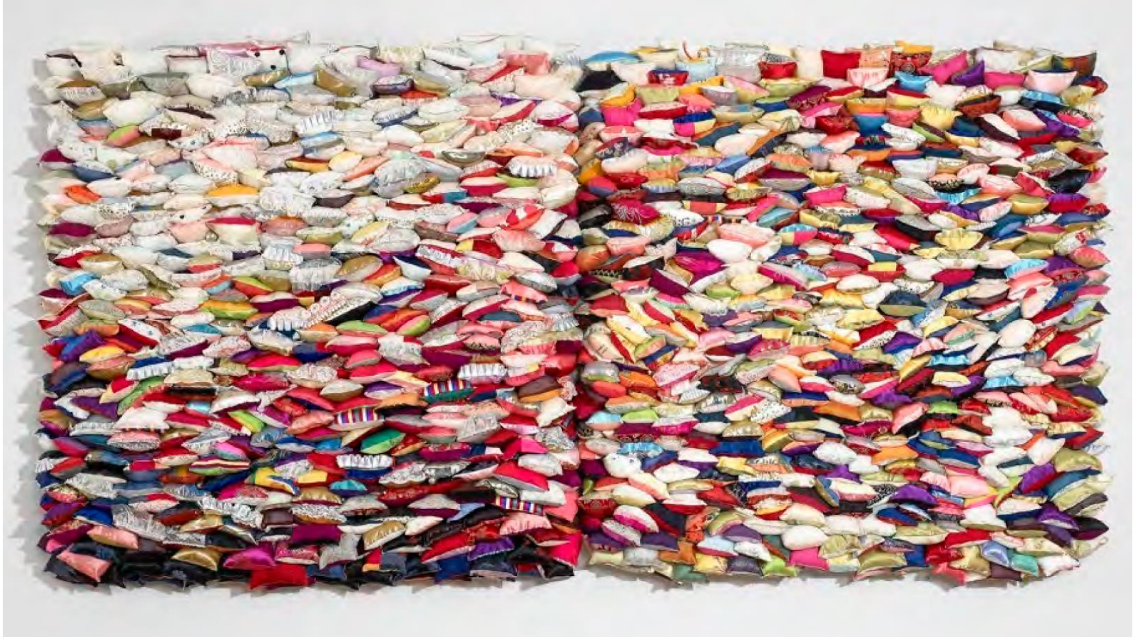
Pillows 2014 150 x 150 x 15 cm (each) Hanbok fabric, cotton