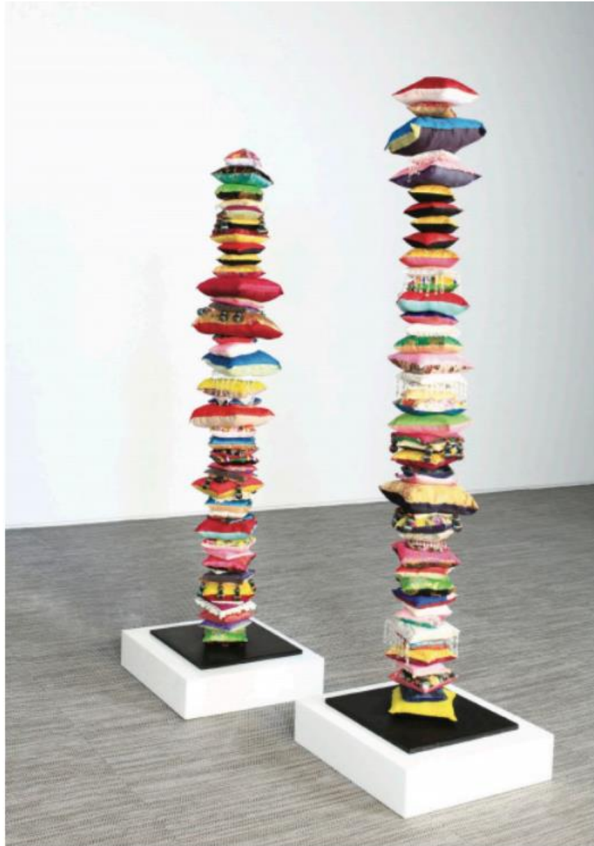
Untitled, 2018 Cloth, cotton 50 × 15 x 15 cm