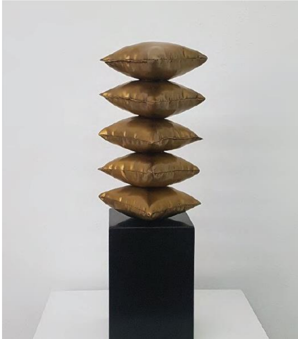
Metamorphosis, 2018 Cast bronze