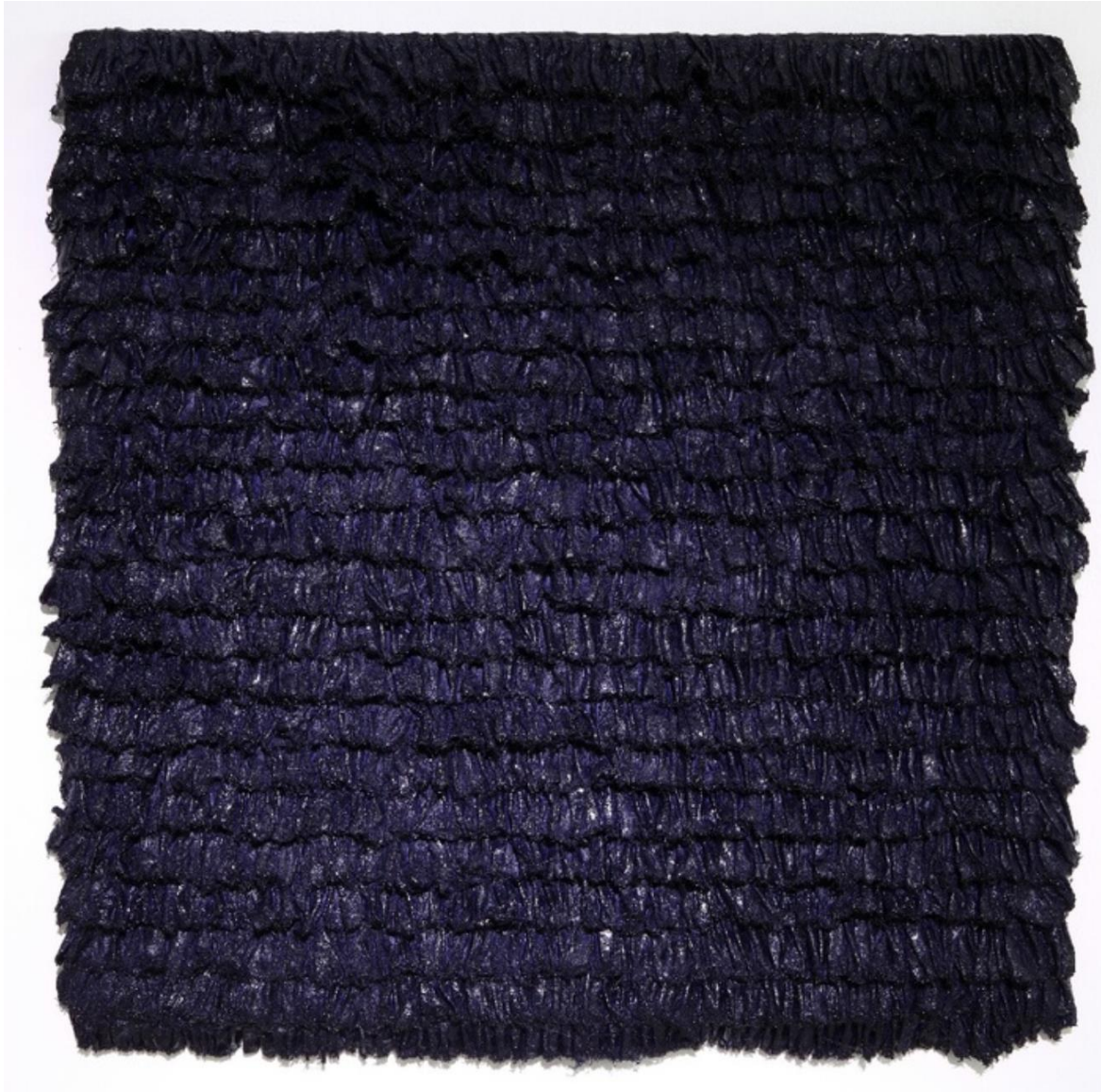
Untitled (White Dreams), 2018 plaster bandage, auto paint 150 x 150 cm