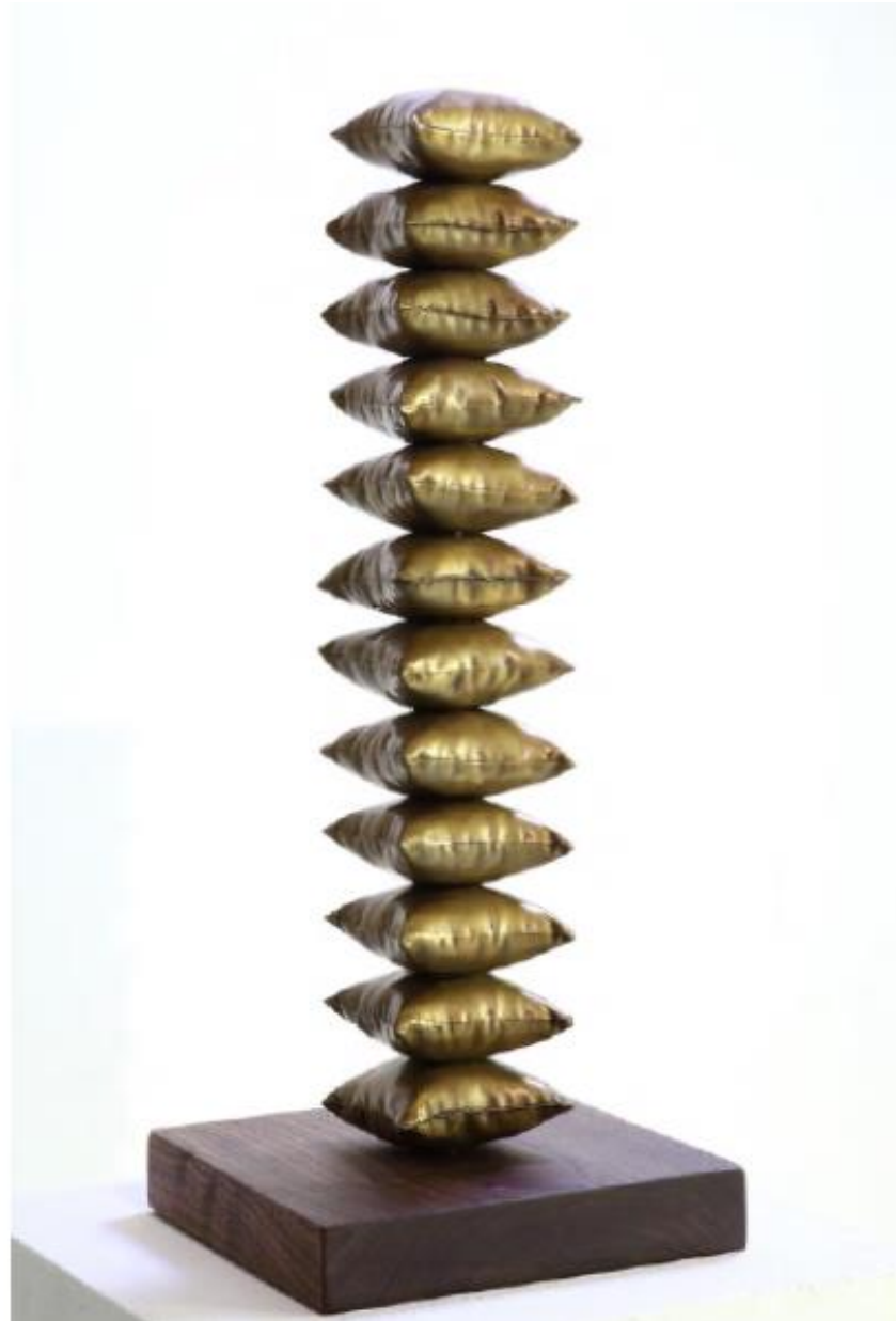
Metamorphosis, 2017 Cast bronze 57 × 11 × 11 cm