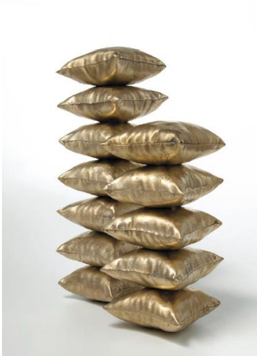
Metamorphosis 2016 Cast bronze