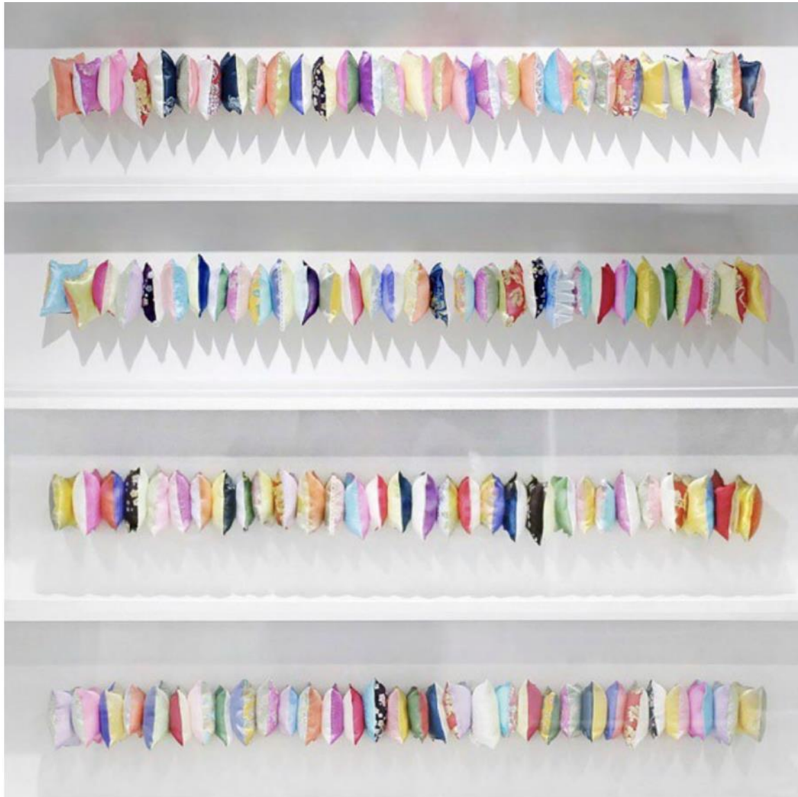
Small dreams 2014 Hanbok fabric, cotton