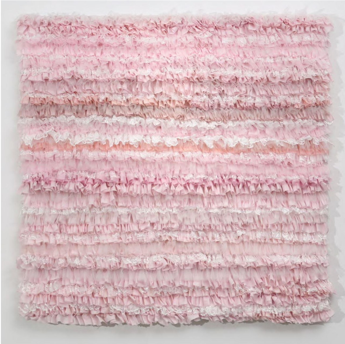
Untitled (White Dreams), 2018 plaster bandage, auto paint 150 x 150 cm