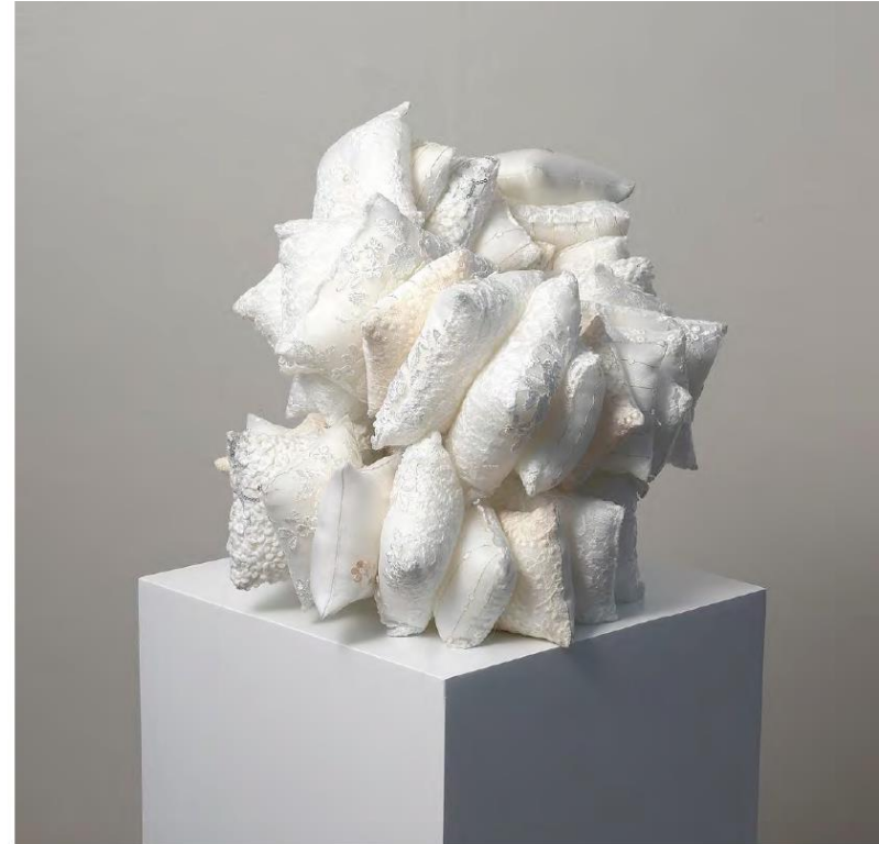
Molding Series, 2018 Size Variable Hanbok fabric, cotton, wire