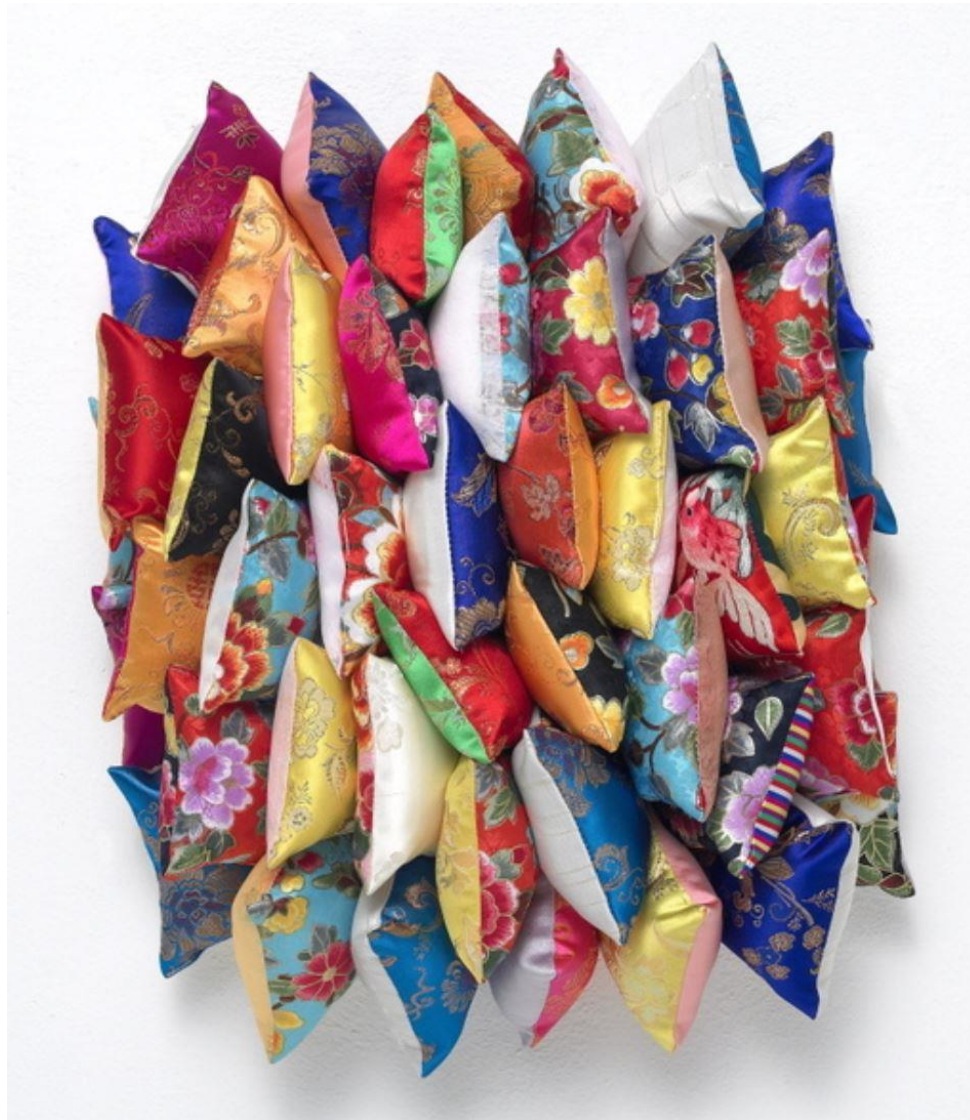
Pillow 2018 40 x 36 cm Hanbok fabric, cotton, wire