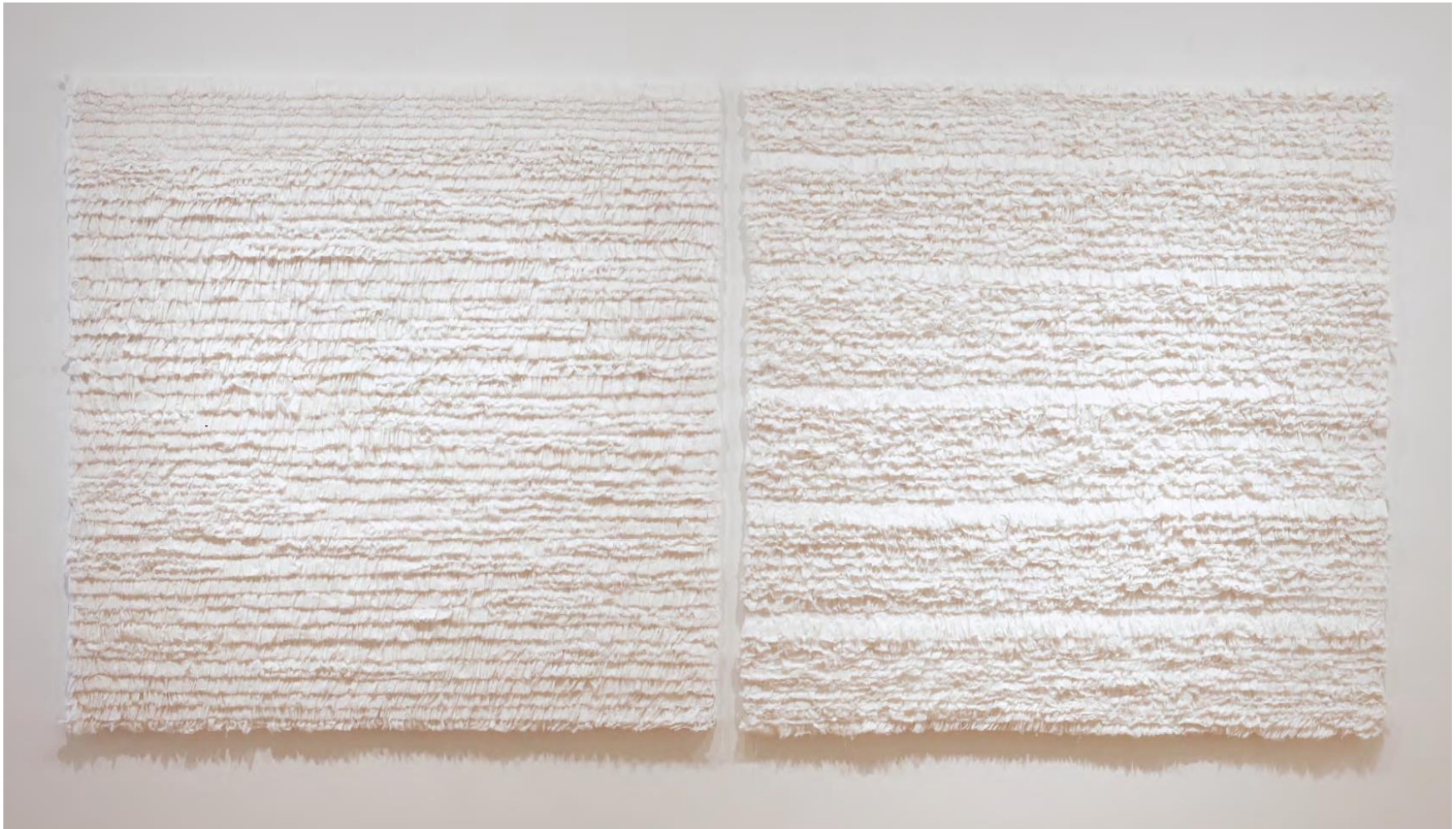
Untitled (White Dreams), 2013, plaster bandage, 160 x 160 x 8 cm (each)